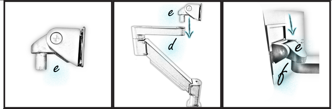
Locate the tilter (e) and insert it into the arm (d). Locate the rail (f) on the back of the tablet and slide the rail (f) onto the tilter (e)

Locate the C-clamp (c), Allen key (a), and base plate (b). Locate a sturdy table edge and tighten the C-clamp (c) by using the provided Allen key (a). Be sure to attach the base plate (b) to the bolt before tightening the C-clamp. down. Locate the arm (d). Slide the arm (d) into the C-clamp (c).