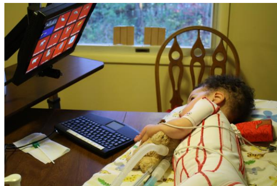
Side-lying 18 month old user

A user should be able to determine precisely where they'd like their Eyegaze screen. The Eyegaze Edge has an external camera that can be adjusted to the comfort of the user . While most users prefer the top of the screen at eye level and in front of them, the Edge can be positioned considerably below eye-level or off to the side so it doesn't block the user's field of view. As long as the Edge system's camera is able to see the user's pupil, no matter what their position or the position of the screen, the Edge will work. It can be focused so the user is as little as 18 inches from the screen or as far away as 30 inches, depending on the user's preference.