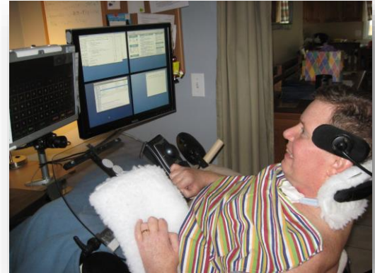
User programming a Mac with Eyegaze Edge

Limited eye movement in some people with very advanced ALS makes it difficult or impossible for them to perform the more complex Eyegaze functions, such as typing, on traditional Direct-select Eyegaze keyboards. Two solutions are included in every Eyegaze Edge: a large-key two-stroke keyboard and a scanning keyboard with an eye motion switch. Additionally, the optional Grid 3 Eyeworld program makes it possible to create custom screens that can accommodate limited eye movement.