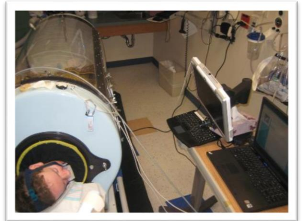
Eyegaze user with SMA in the ICU

After evaluating several dozen girls with Rett syndrome we have not determined any predictors for successful Eyegaze use. Many of the girls were too easily distracted to use Eyegaze in any meaningful way, although they were able to calibrate without difficulty. More research should be geared toward using eye tracking analysis software to determine the efficacy of Eyegaze use with Rett Syndrome for communication.