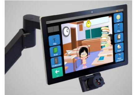
Eyegaze Edge Tablet

The Eyegaze Edge is an eye-controlled communication and control system. The Edge uses the pupil-center/corneal-reflection method to determine where the user is looking on the screen. An infrared-sensitive video camera, mounted beneath the system's screen, takes 60 pictures per second of the user's eye. A low-power infrared light emitting diode (LED), mounted in the center of the camera's lens, illuminates the eye. The LED reflects a small bit of light off the surface of the eye's cornea. The light also shines through the pupil and reflects off of the retina, the back surface of the eye, and causes the pupil to appear white. The bright-pupil effect enhances the camera's image of the pupil so the system's image processing functions can accurately locate the center of the pupil.